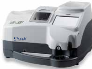
LE-800 with frame tracer (optional)